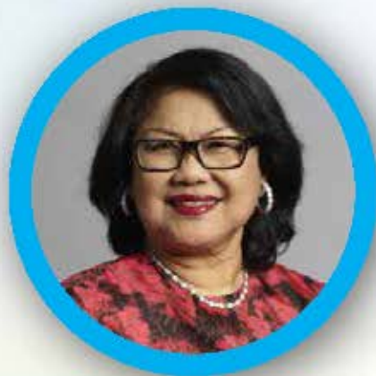
Tan Sri Rafidah Aziz