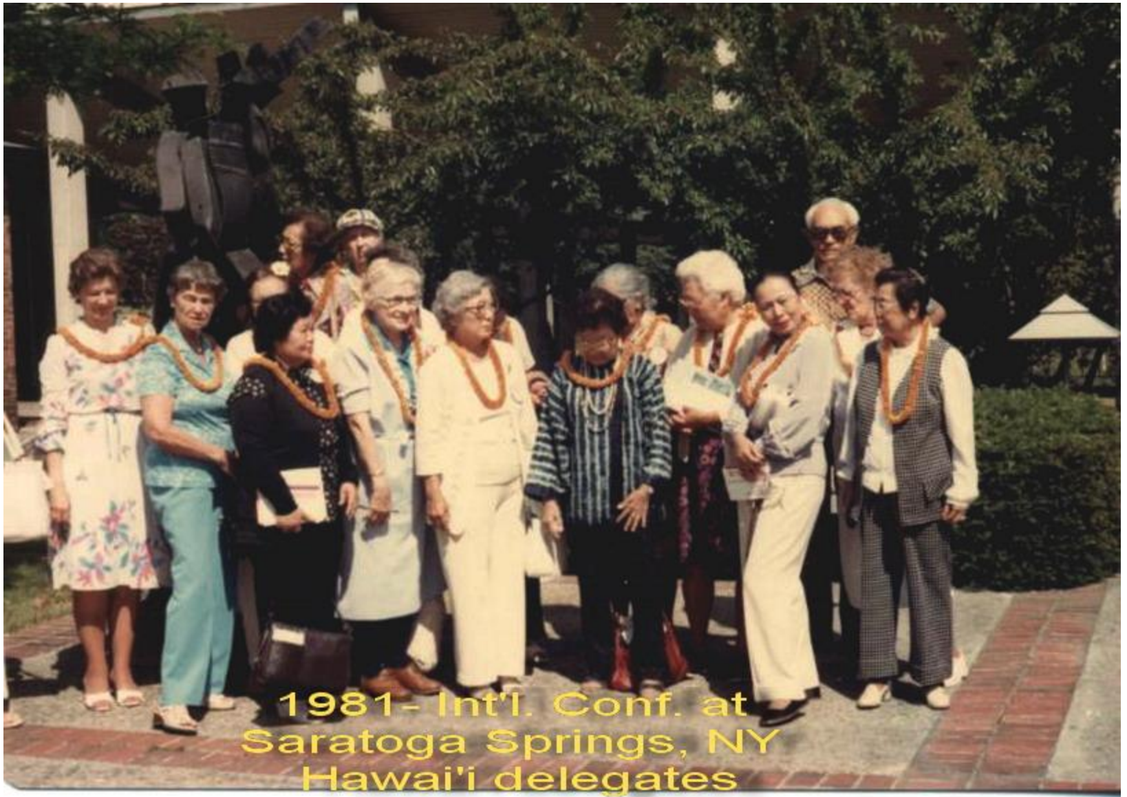
1981- Int'l. Conf. at Saratoga Springs, NY Hawai'i delegates