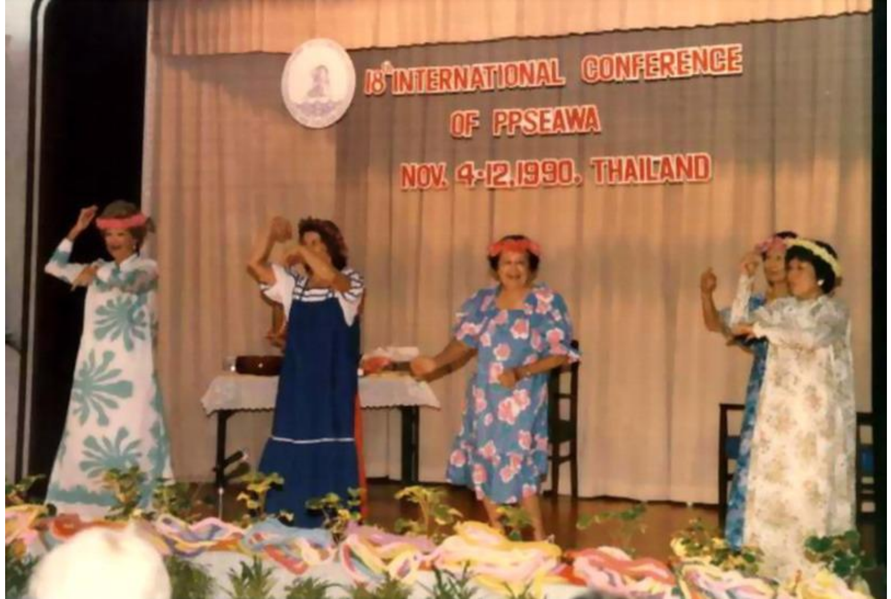
On stage: our first Hula presentation: Bangkok, 1990