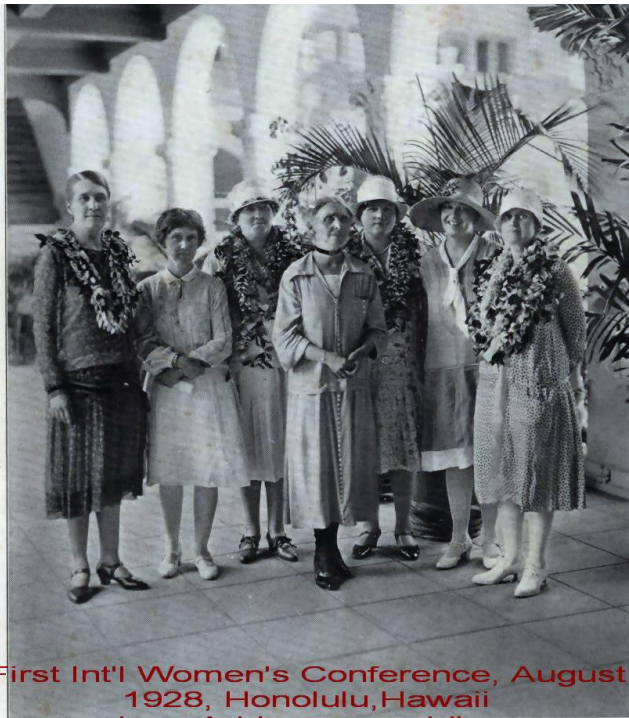
First Int'l Women's Conference, August 1928, Honolulu, Hawaii Jane Addams, presiding